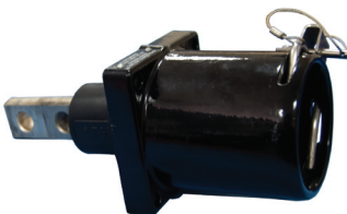
Short Throw Design