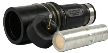
Complete Female Plug with contact shown