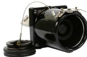
Rotating Stainless Steel Latch Design