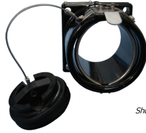
E1049-1808X-BK - Rotating Latch