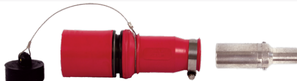
10 Colors available