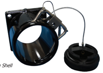
E1049-1808ST-BK - Short Throw Latch