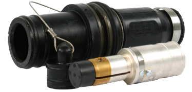
Complete Male Plug with contact shown